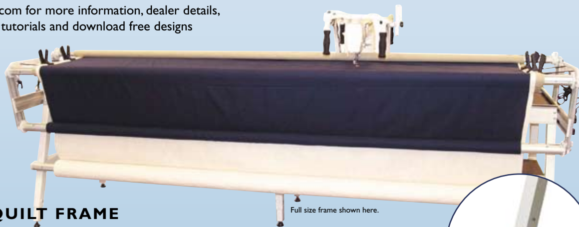
Full size frame shown here.

Visit MyQbot.com to watch videos showing wonderful samples, and how to use the QBOT software!