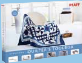
Quilters Toolbox P8208400-96

For Creative Vision, 4.0, 2.0, expression 4.0, 3.0, and 2.0