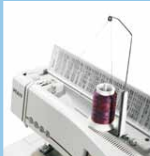
Creative Spool Stand P8206120-96