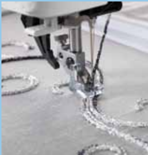
Yarn Couching Foot P8209120-96